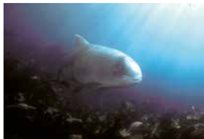
Harbour porpoise.

Current priorities include reducing bycatch and underwater noise, understanding the impacts of emerging issues such as tidal and wave energy as well as the cumulative effects on small cetaceans and of all the human pressures on the marine environment. In a collaborative manner, ASCOBANS works to develop and agree solutions and mitigation strategies. ASCOBANS supports the SDGs related to the protection of marine ecosystems, but also in terms of education and international collaboration of its Parties.