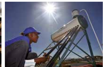
Kuyasa UN Clean Development Mechanism Project, Khayelitsha, South Africa.