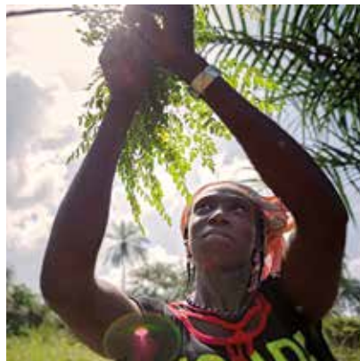
A community project to build resilience in Guinea cultivates Moringa to prevent soil Erosion.

To find out more about disaster risk reduction and how to get involved please visit: https://www.unisdr.org/we/campaign and www.preventionweb.net