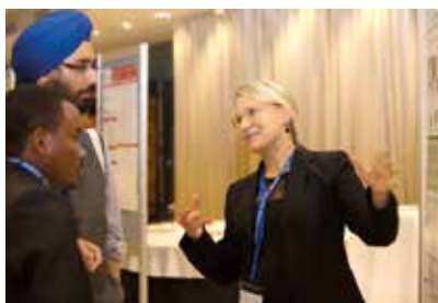
Poster session at a conference organised by UNU-WIDER (World Institute for Development Economics Research) Helsinki, Finland, 2015.

UNU-ViE is committed to ongoing cooperation with other UN agencies, as well as local, regional, national and international stakeholders.