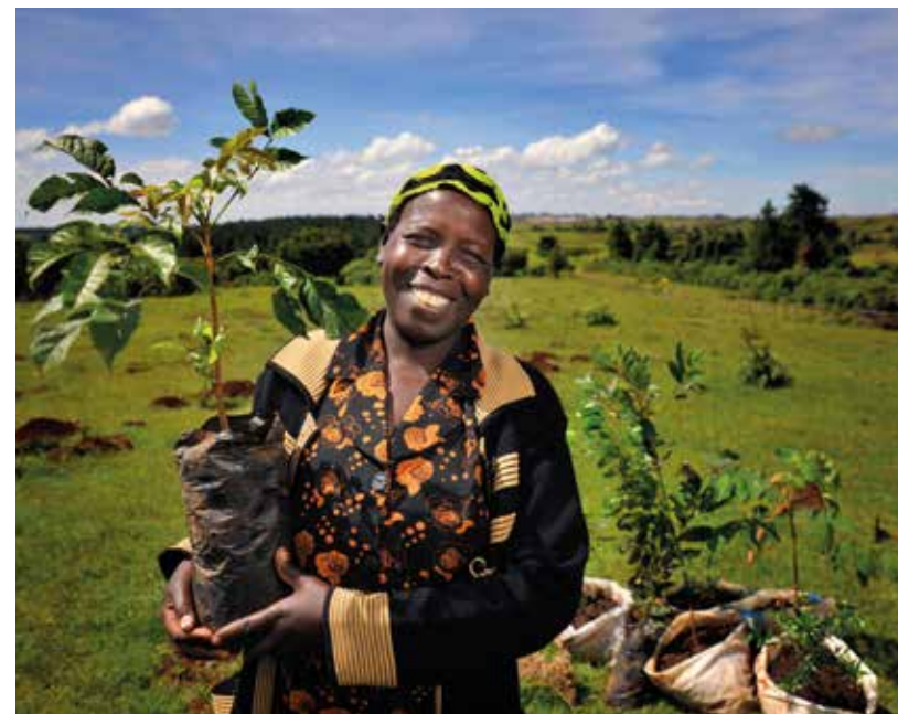
Restoring the soils of degraded ecosystems has the potential to store up to 3 billion tons of carbon annually.