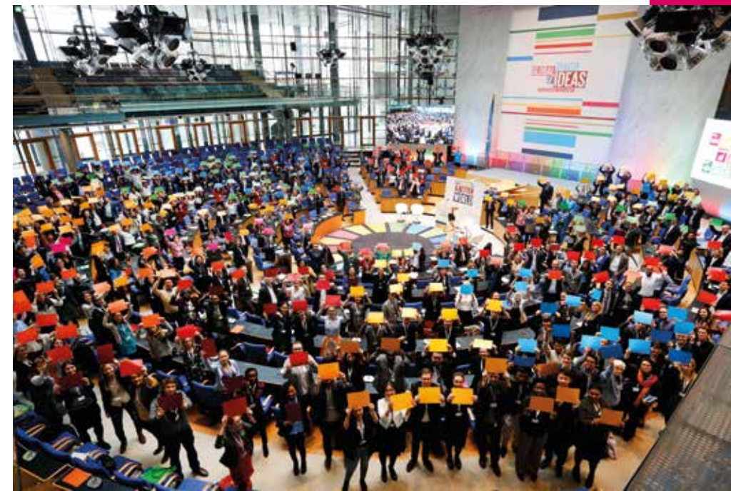
The annual Global Festival of Action for Sustainable Development brings together leading thinkers, policy-makers and civil society, together with gaming experts to explore trends, innovations and tools, and transform the way we think and act on Sustainable Development.