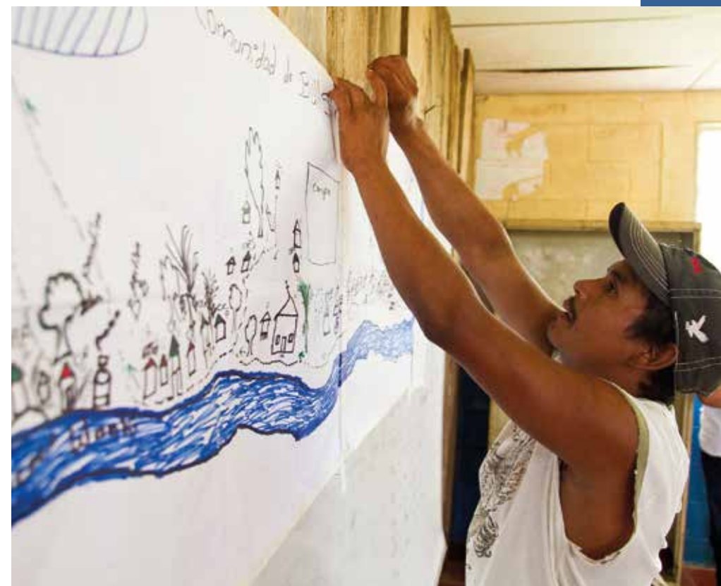
A community maps the risk of a local river overflowing. A simple but effective measure to reduce the risk of disasters.

Hans T. Sy, SM Prime Holdings, Inc. Philippines