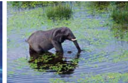
Elephant of the Okavango Delta