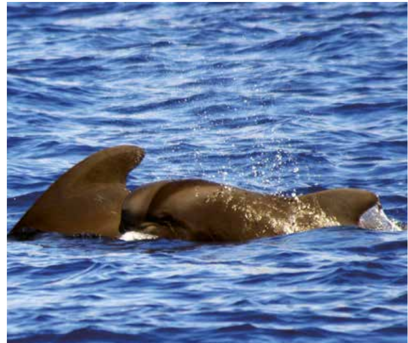
Pilot whales, mother and calf.