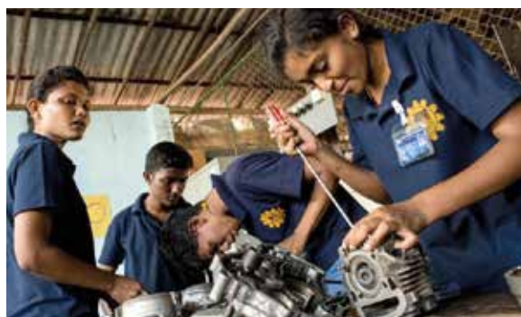
Youth empowerment and challenging gender stereotypes through skills development and TVET.

UNESCO-UNEVOC promotes knowledge sharing through its research and online communities, including the TVET Forum and UNEVOC Network Portal. Register on our portal and join the international debate.