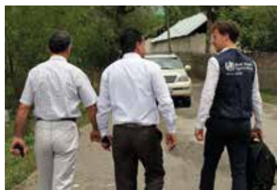
WHO-ECEH staff conducting in-country support work in Central Asia.

These activities are contributing to the development of healthy and safe environments that support resilient and inclusive communities. Our mission is to achieve improved and more equitable health and well-being for all people of the WHO European Region and to contribute to a global environment and health agenda.