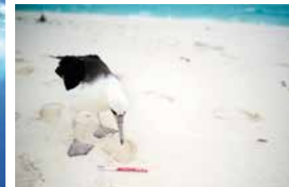
In 2016 the Marine Debris team removed hundreds of toothbrushes from the shorelines of Midway Atoll.