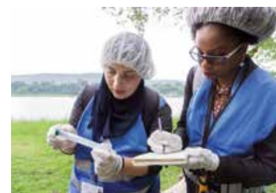
Hazard Simulation Exercise - simulating a flooding of the river Rhine in Bonn, May 2017. Two participants of the Intensive Summer Course „Advancing Disaster Risk Reduction to Enhance Sustainable Development in a Changing World“.