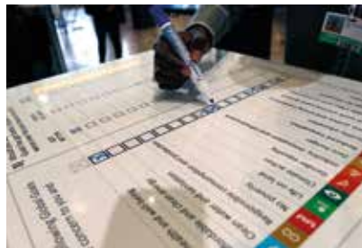
Through the MY World 2030 Survey, people everywhere can have their say on how their country is doing on the SDGs and drive political change.