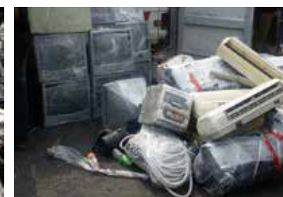
E-waste export to Africa.