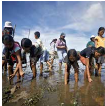
Children participate in a mangrove restoration project in the Philippines, helping to reduce the impact of tsunamis.