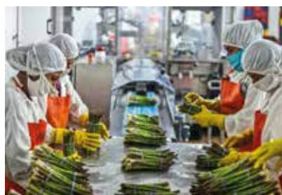
Brokering investment and technology agreements between developed, developing countries and economies in transition.