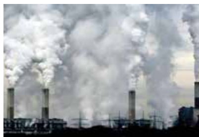
Air pollution is the single largest environmental health risk in Europe.