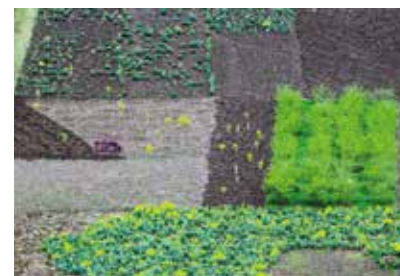
Humans obtain more than 99.7% of their food (calories) from land.