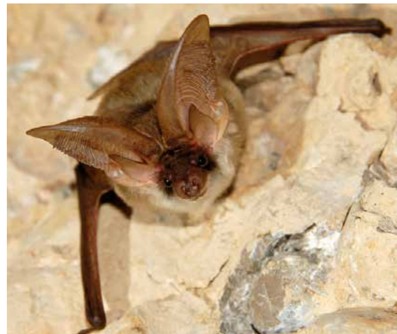
Long-eared bats live in forests and feed on moths and butterflies they collect from plant surfaces.