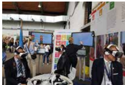
Interactive exhibitions bring people's voices to decision makers, show interactive data on people's perceptions of the SDGs and inspire participants to move from empathy to action through virtual reality experiences.

The Global Campaign Center in Bonn is a strategic hub to deliver the UN SDG Action Campaign's mandate to inspire people's action on the Sustainable Development Goals. The Global Campaign Center is central to the UN's strategy of providing real-time cutting-edge advocacy support, big data expertise and analytics to Member States and partners across the globe.