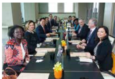
By mobilizing partners and resources to achieve larger development impact, UNIDO drives modern and green industry.

In doing so, investment promotion and the transfer of sustainable technologies have been at the forefront of these efforts. The Investment and Technology Promotion Office (ITPO) in Bonn participates in this endeavour by fostering mutually beneficial industrial cooperation between enterprises in Germany and in developing countries.