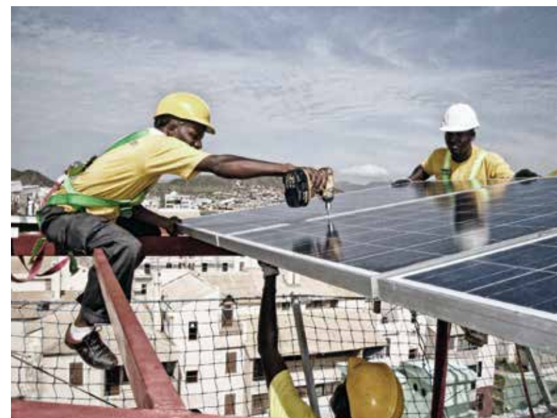
UNIDO ITPO Bonn opens up opportunities for investors and technology suppliers to find potential partners.