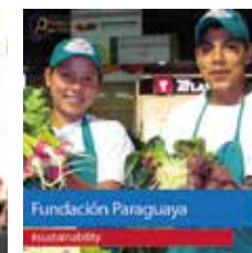
Fundacion Paraguaya, a UNEVOC Centre in Paraguay, not only educates rural and low-income youth but transforms them into entrepreneurs who can potentially lift themselves and their families out of poverty.

Bringing together key stakeholders from across the world to foster actionable strategies for TVET to productive employment, lifelong learning and sustainable development.