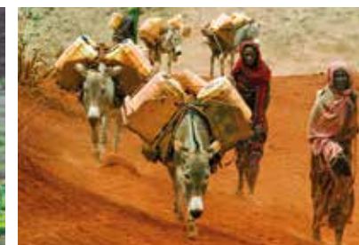
Some 135 million people may be displaced by 2045 as a result of desertification.