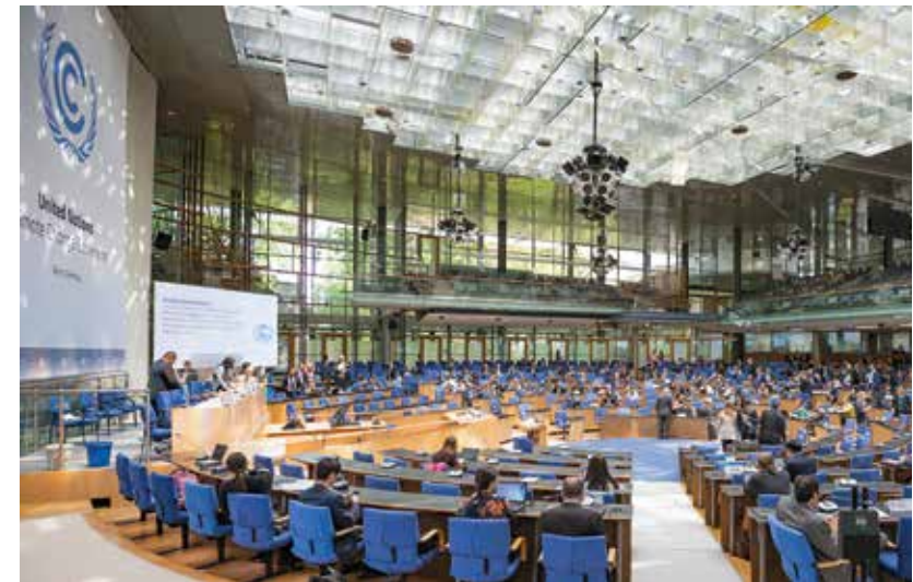
A Conference of the UNFCCC Secretariat in Bonn, Germany.

Leonardo DiCaprio, UN Messenger of Peace