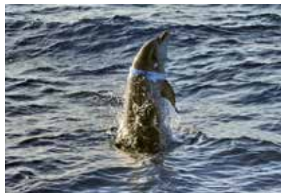
Bottlenose dolphin with litter around its neck.

Buy fish only from sustainable fisheries, avoid littering, support beach or river clean-ups as well as conservation organizations, and choose whale watching operators that treat the animals with respect.